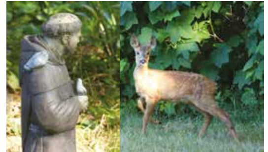
Francis and some of our wildlife