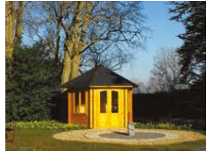
Meditation hut in the garden