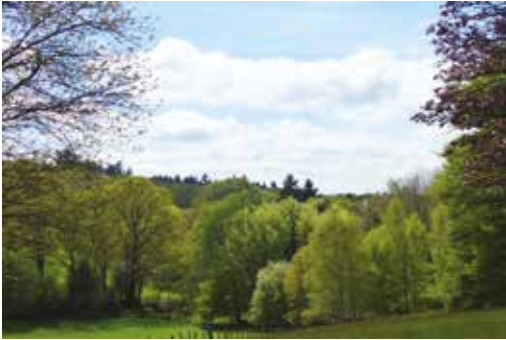
Across the valley

A day exploring feeling in all senses of that word! How we feel with our physical senses and how we feel emotionally, and how we feel with our etheric senses and how we feel intuitively, as well as how these are connected. A relaxed, experiential day open to all. White Eagle says this: 'Remember the importance of feeling, because through feeling you develop the Christ within...Do not be ashamed of your feelings. They are the pointers, the guides which direct you along the path of Light.'