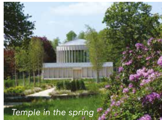
Temple in the spring

In between the gardening and cooking we will have time for meditation, attunement, relaxation and, if you wish, sharing of experiences.