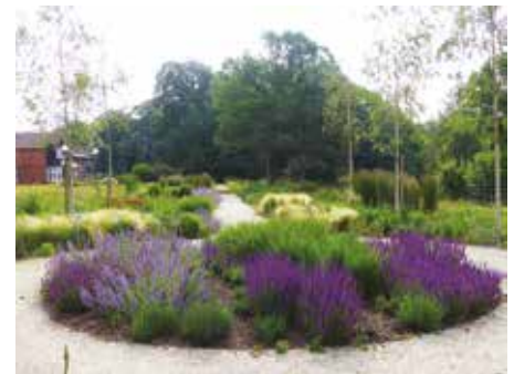
Throat chakra planting

This is a combined gardening and spiritual retreat. We will particularly focus on what the angels can show us for our spiritual journey—how we can work with them. We will be doing this through gardening on New Lands estate, exploring how awareness of the natural world can help us come closer to the angels. We will be doing some gardening, having meditative walks and meditations, as well as talks and sharing.