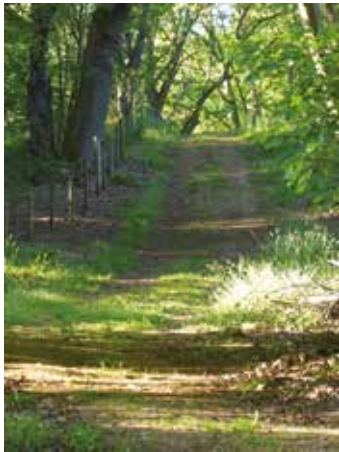
Walks in the wood