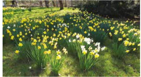
Daffodils on temple drive

If you have participated in the distant healing work for at least one year, and would like to be involved in the contact healing, please contact frank.hansen@white-eagle.org.uk or phone +44 (0) 1730 893 300 for information.