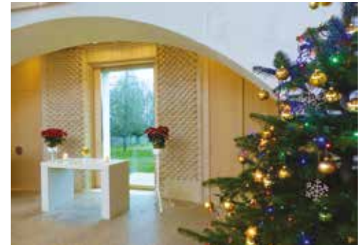
Inside the temple at Christmas