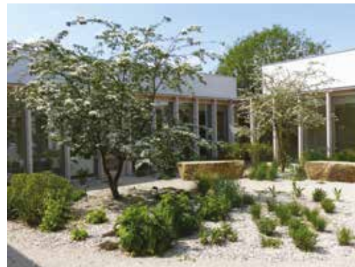
Temple courtyard in spring

An exploration of one-ness through White Eagle readings, poetry and sound, walking in nature, movement and stillness in meditation.