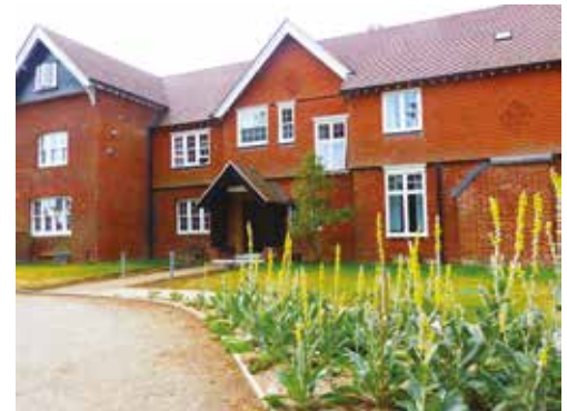
Newlands retreat house

Minimum 2 nights. Facilitator place free of charge.