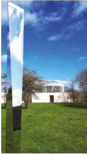
Crown chakra sculpture

Is what Jesus taught something we can use in our modern lives? What Jesus showed us is, in many ways, timeless and indeed something we can still use as inspiration. In this retreat we will explore this subject in the light of White Eagle's teaching and try to discover how we can use it in our everyday lives. There will be time for meditation and contemplation and mindful exercises and, if you want, sharing of experiences.