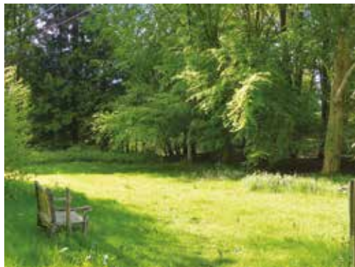
A quiet place to sit

Such a beautiful time of year to open ourselves to the creative streams of life; to find our imaginations stimulated, and all the senses freed to explore. Come on a journey into other realms within yourself and in the natural world through sound, colour and perfume, and the power of words.