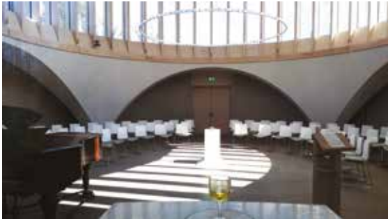
The play of light in the Temple of Light