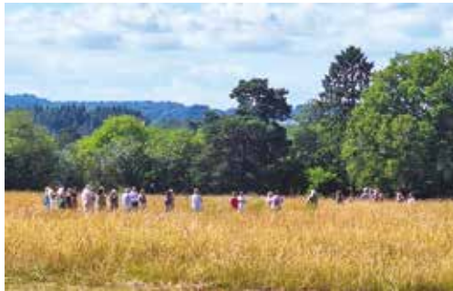
Cross within the circle activity